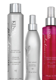
Boost & Protect