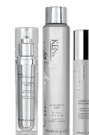
Smooth & Straighten